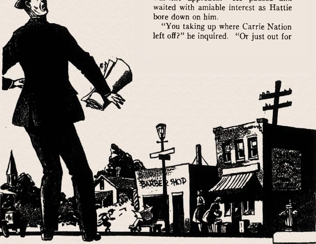
Pedastrians and shopkeepers drew back in alarm at sight of the war-like figure

Near the El-station a tall young man with crooked eyebrows observed her war-like approach. He paused and waited with amiable interest as Hattie bore down on him