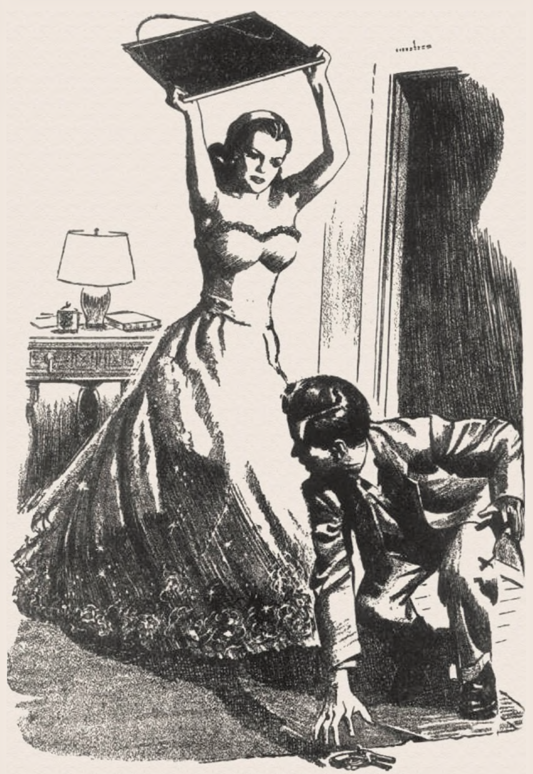
I was bending to pick up the gun when she whirled around, the picture reised 60\,