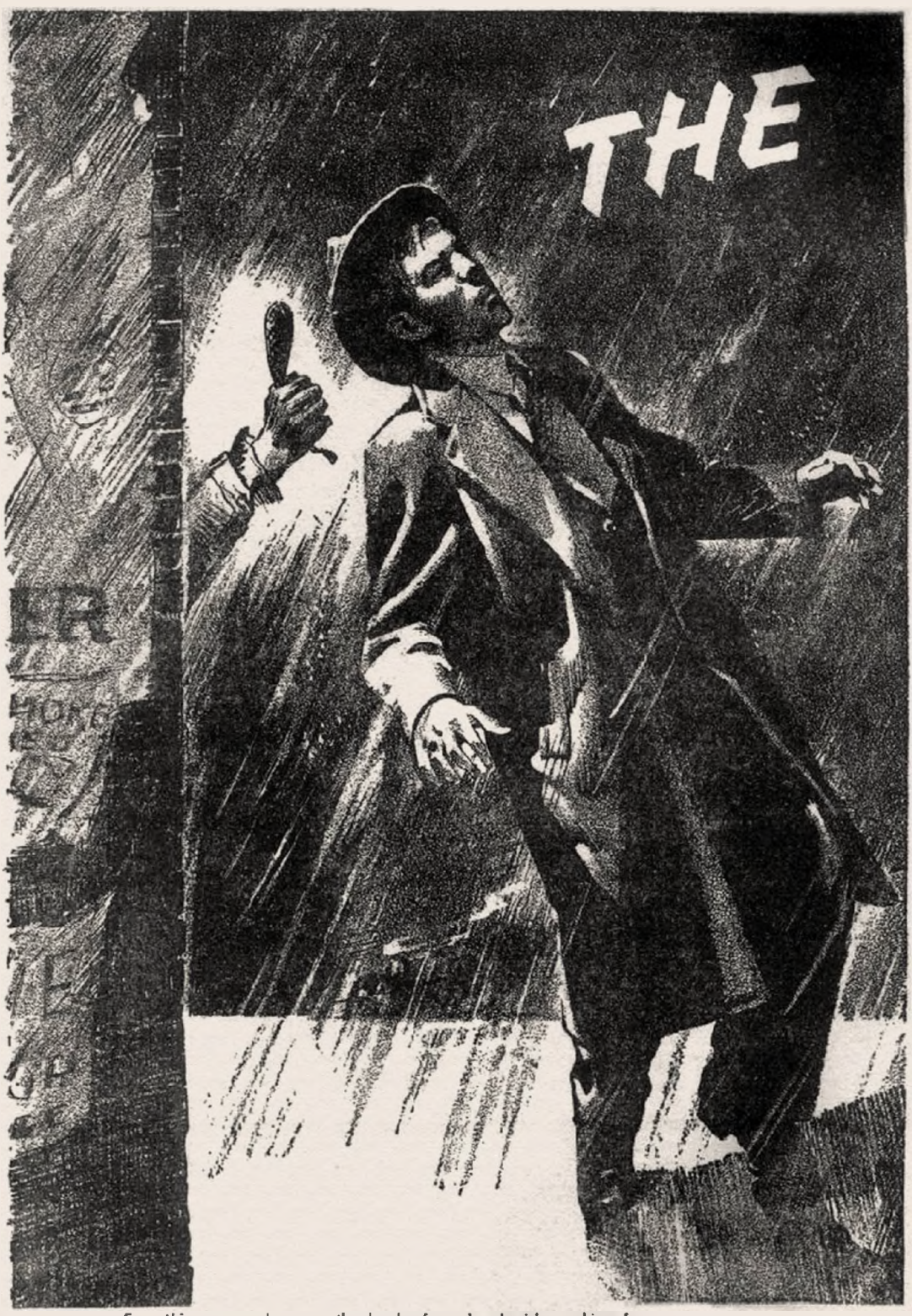
Something came down on the back of my head with crushing force . . .